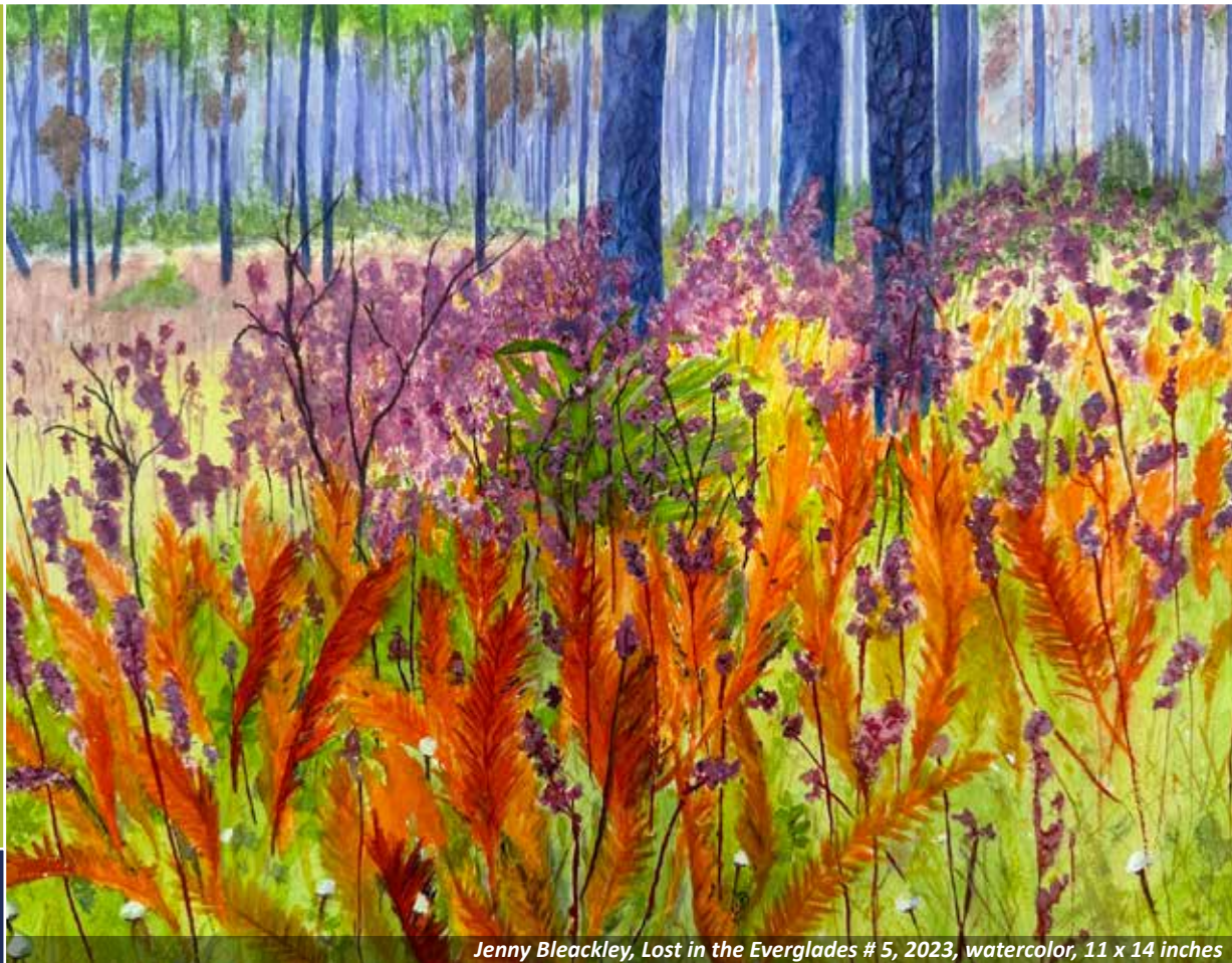
Jenny Bleackley, Lost in the Everglades # 5, 2023, watercolor, 11 x 14 inches