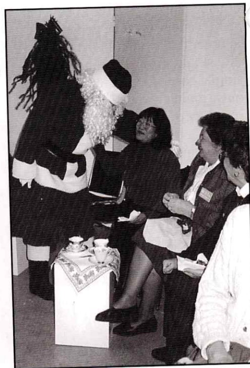
Santa , spreading good cheer