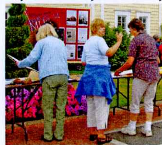
Grand Prix sign in