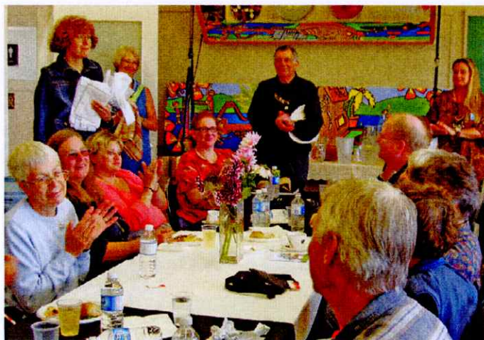
Artist's luncheon & GP awards