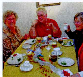
Toasting the volunteers