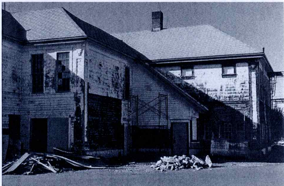
Above: looking back at The Old School House building in 1987