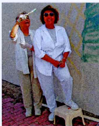
Memorial fence painting