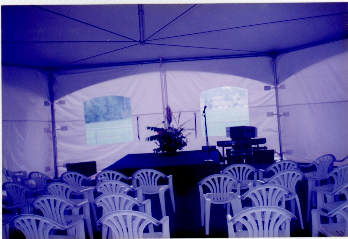
TENT ADJOINING TOSH SET UP FOR PROGRAMME