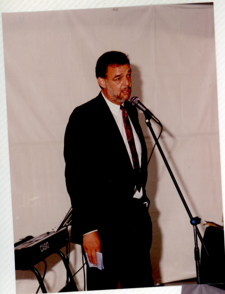
MAYOR PAUL REITSMAN PARKSVILLE