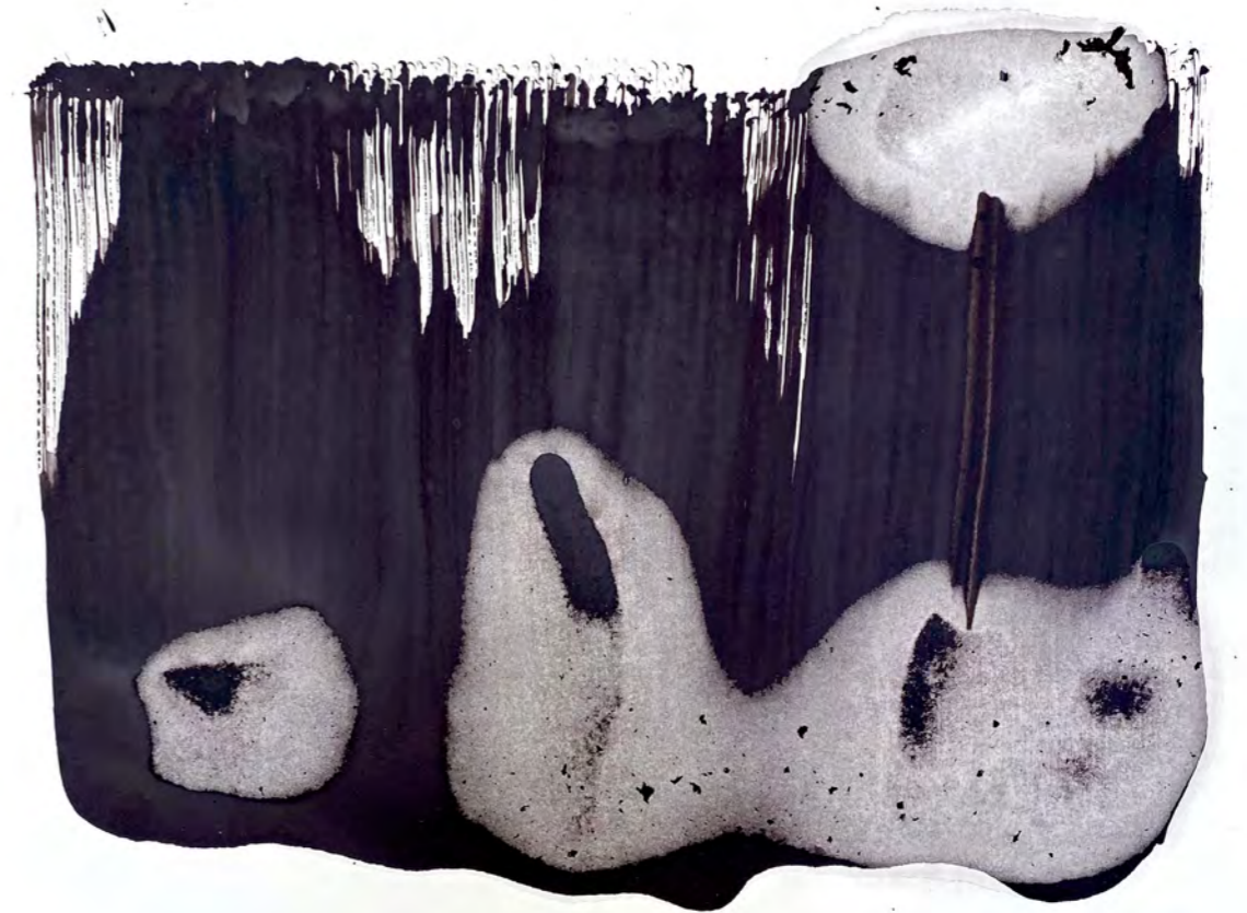
Chawan, 26½ X19½ inches, acrylic on paper, 2020