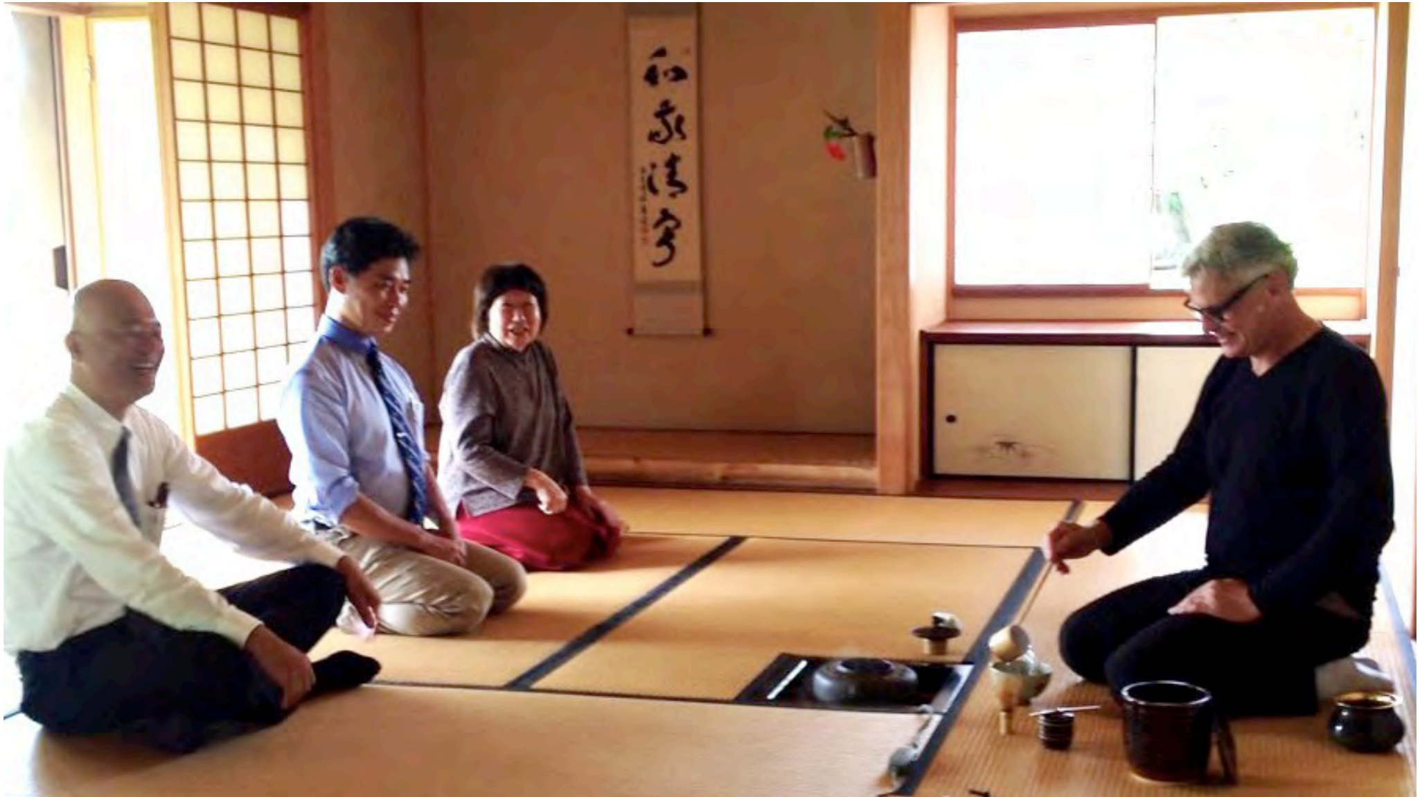
Tea ceremony at Shoroan tea house, Hilo, Hawai