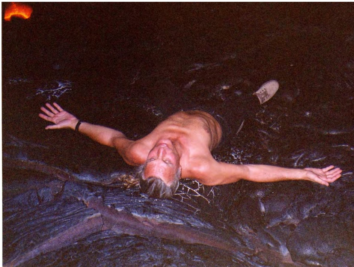
Kilauea eruptive zone 2003