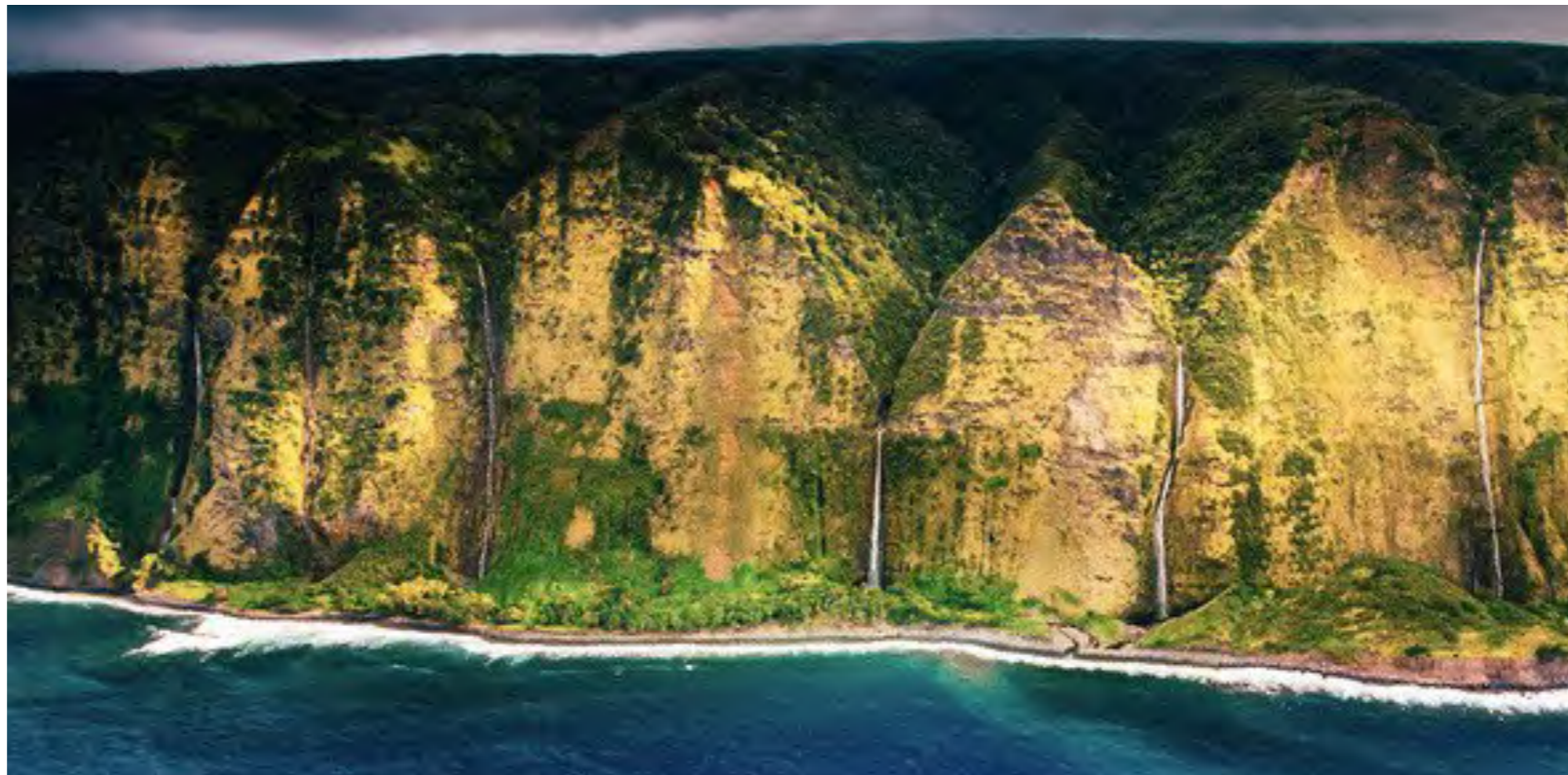
Sea cliffs of Hāmakua Coast, Island of Hawaii