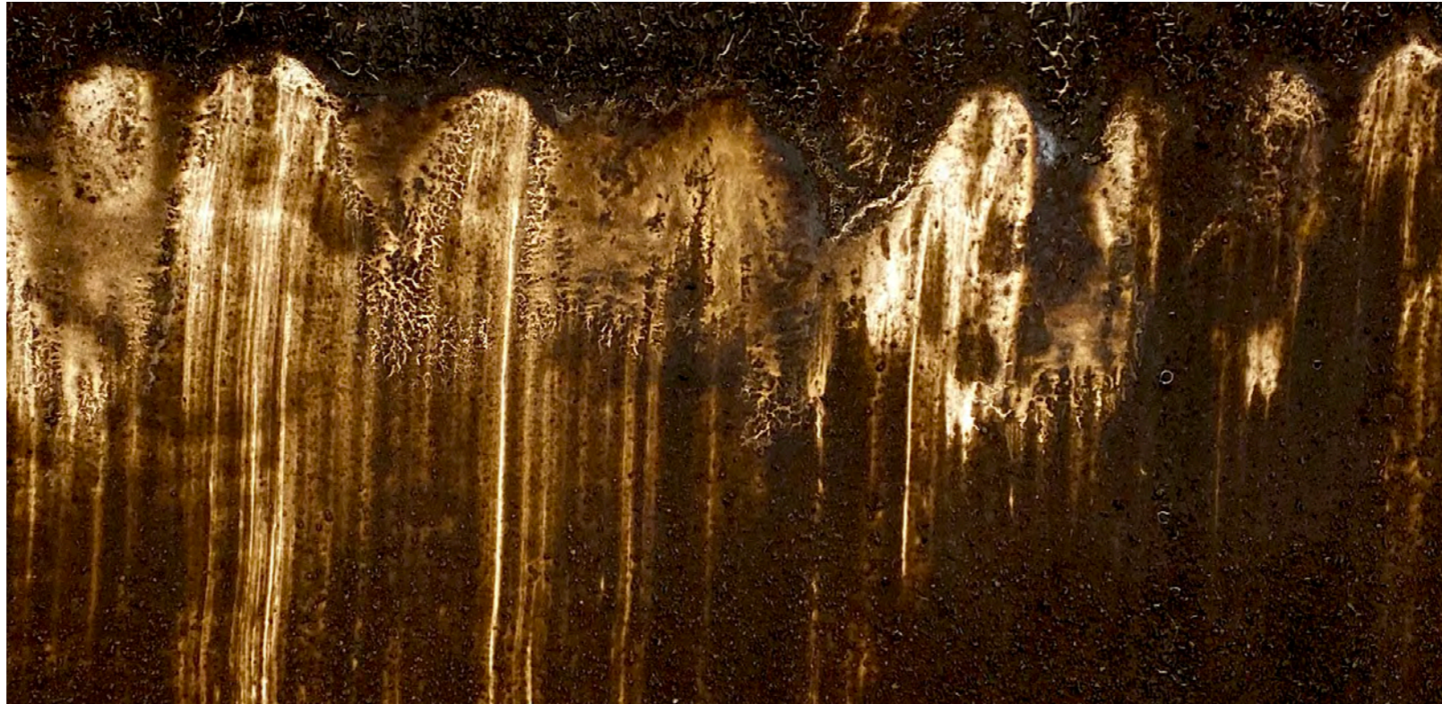
Chawan Landscape (detail), 22x47 in (56x120 cm) Kokokahi soil and acrylic base on paper, 2021