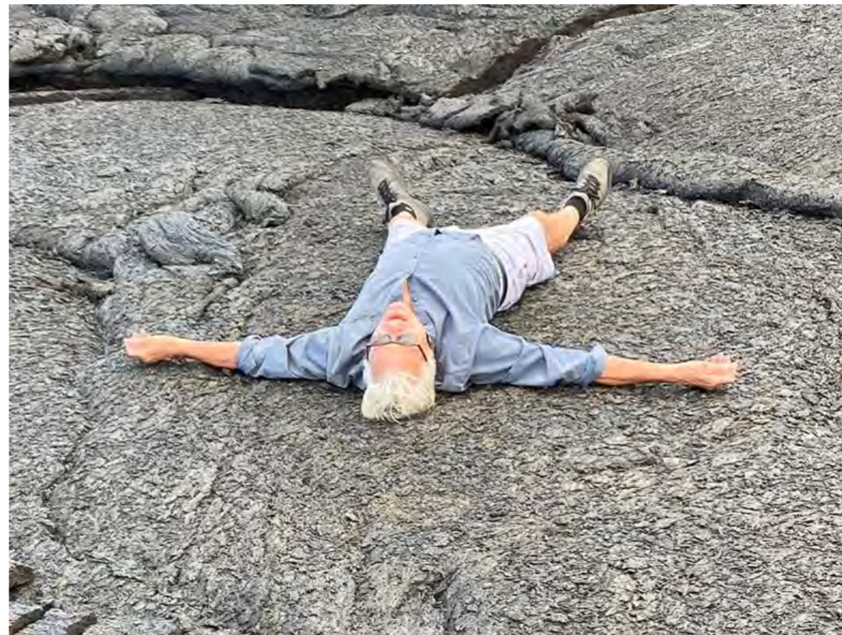
New lava 2020