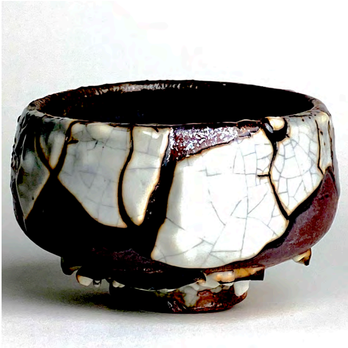
Chawan, shino and iron oxyde glaze