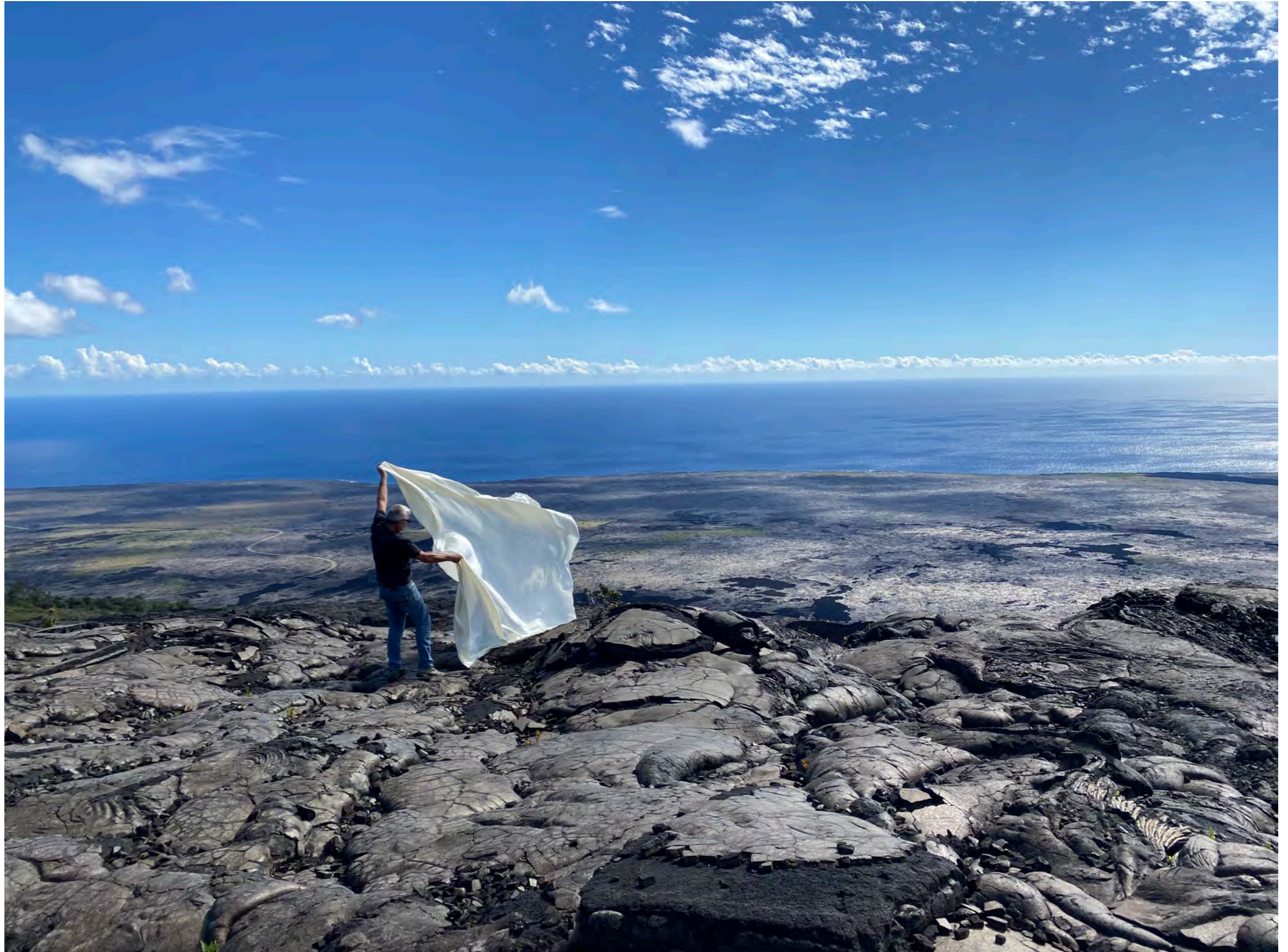
Spreading canvas on Kilauea Volcano lava fields