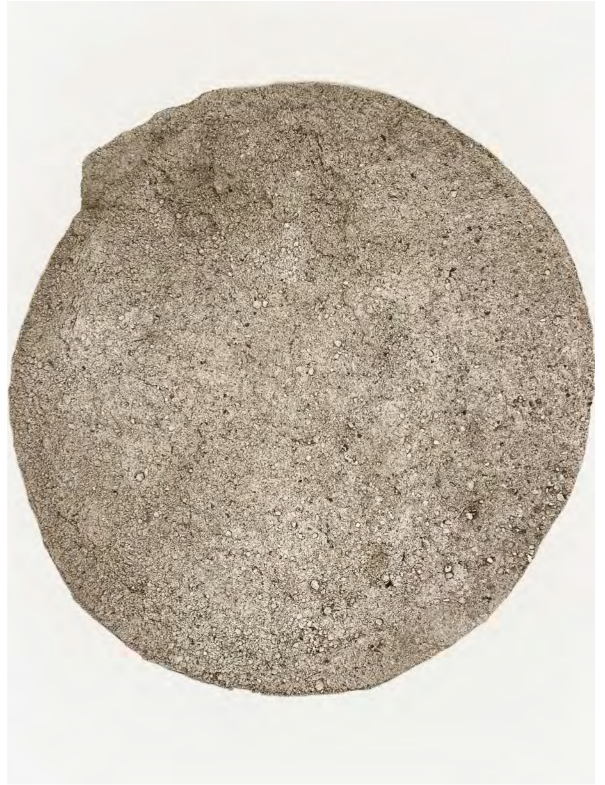
Sumi charcoal ash