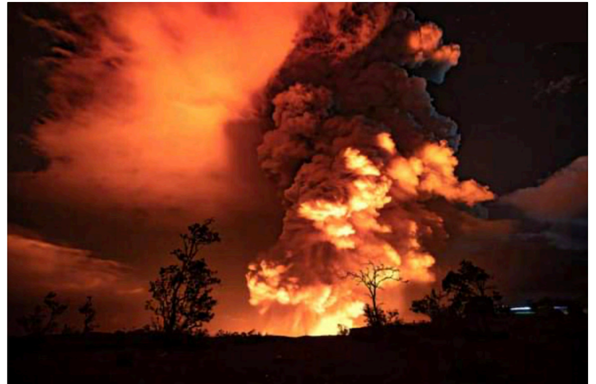
Kilauea Volcano eruption (2018)