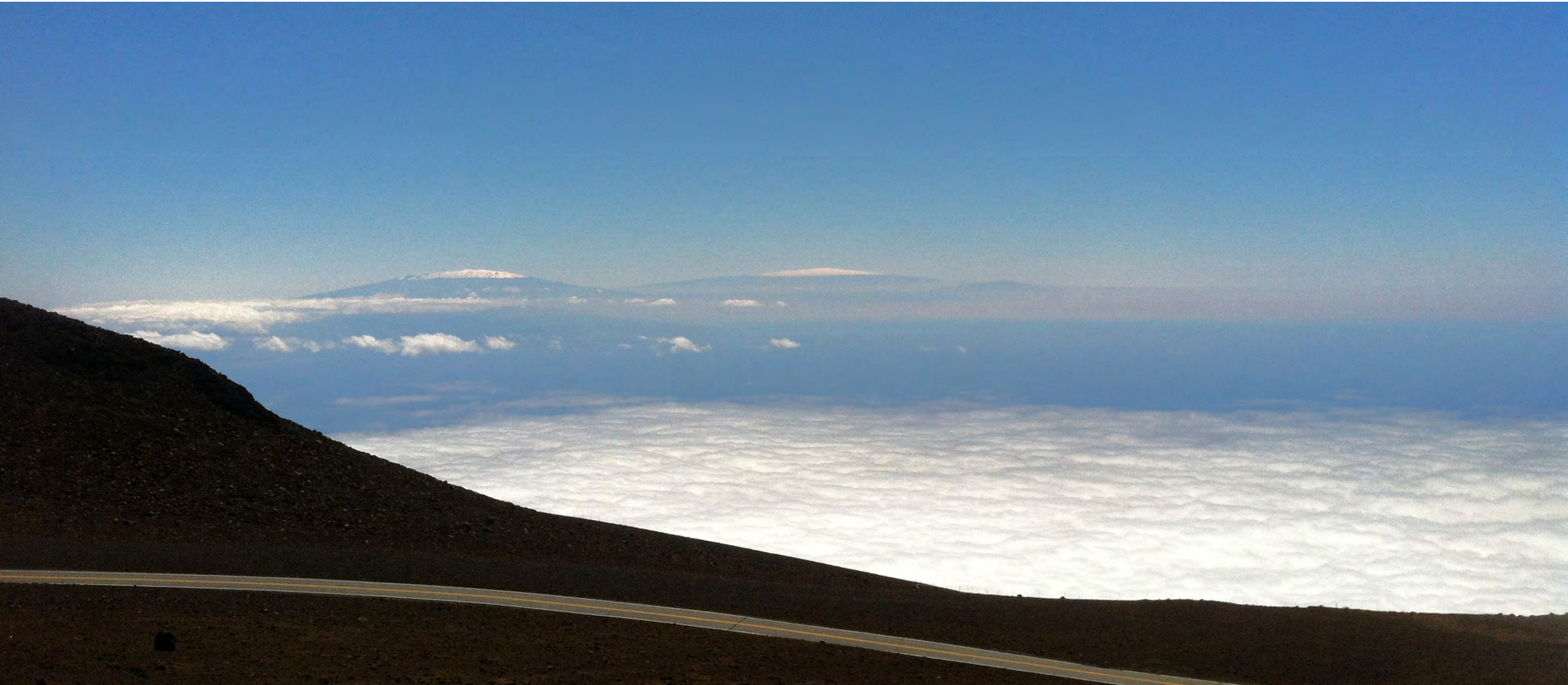
The snow on Hawaii Island summits, seen from Haleakala volcano on Maui Island