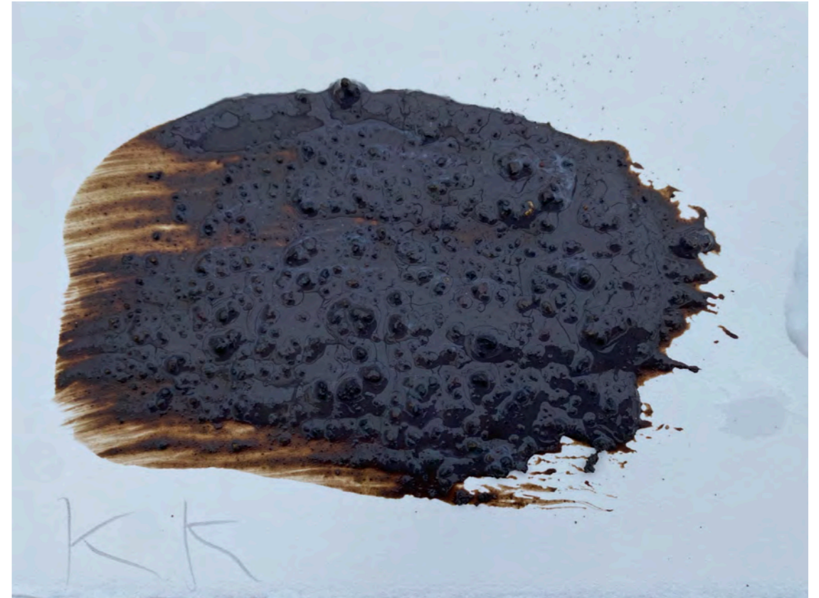
Mud swatches on paper