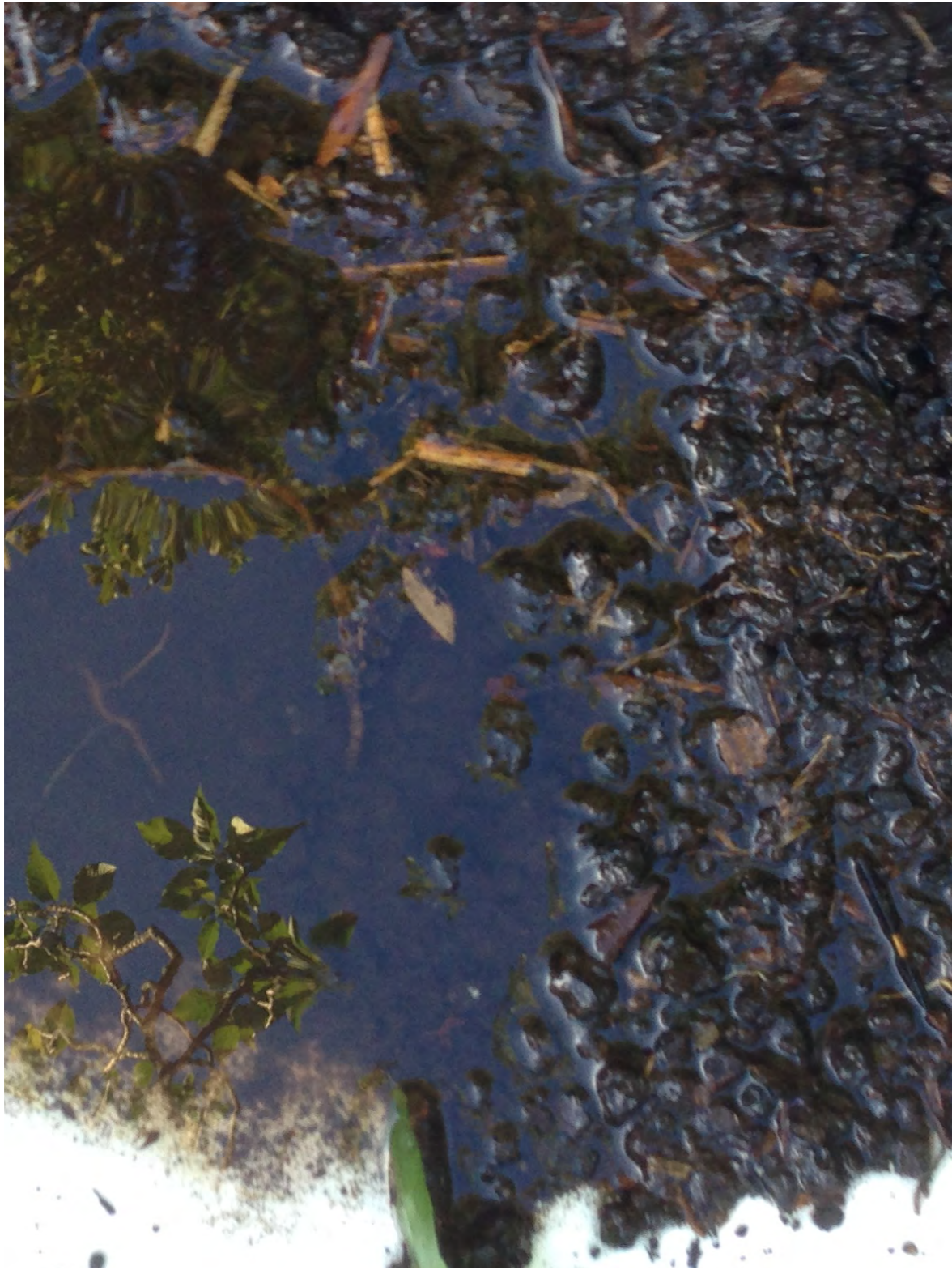
Fern forest mud