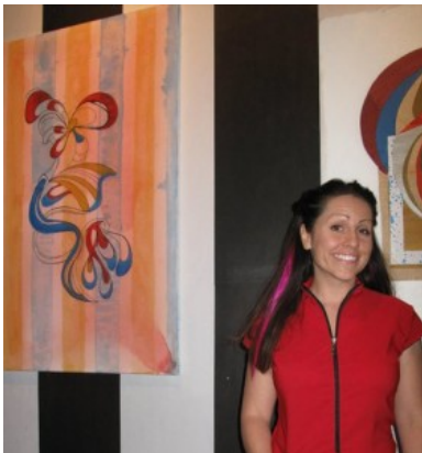
El Tunel, Buenos Aires, Argentina

The same objects, shapes, and people appear and reappear in our lives – in the chaos of nature and exact structures of man. They are constant but forever formulated in a different composition so as to remain fresh in our perspective. This is the approach to my artwork. I use many of the same themes, objects, and shapes. Yet, I revel in their infinite and sundry arrangements - just as with all things in life.