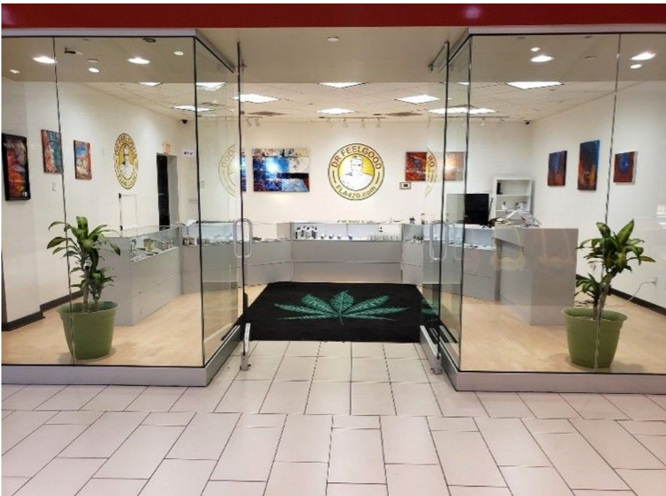
Dr. Feelgood Store at the Volusia Mall, Daytona Beach, Florida.