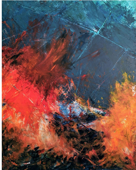
“We Have Ignition”