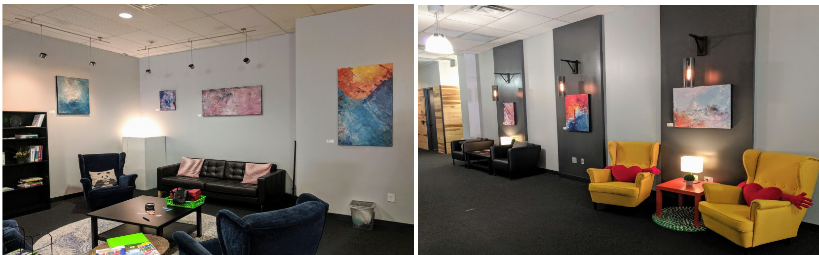
My Paintings at Starter Studio