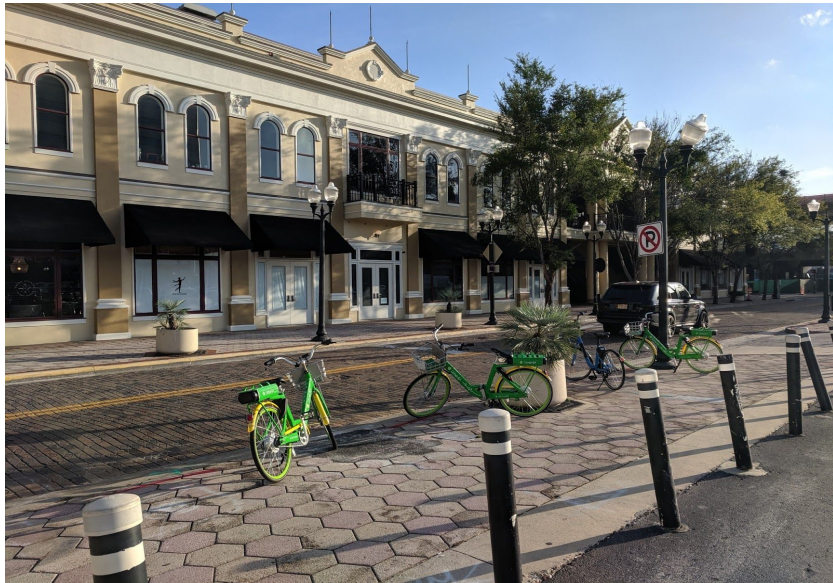
Church Street Exchange Building

A big thank you to Starter Studio for letting me share my art in their space. From their website, www.starterstudio.org , is a 501(c)(3) tax exempt organization that describes themselves as a pioneering hub for innovative and tech-enabled entrepreneurs that empowers and provides resources for entrepreneurs, creatives, and innovators to begin, grow, and flourish in Florida. Through community education programs, accelerators, funding, and collaborative work spaces. StarterStudio fosters a community—serving as a platform for the ideas of the future.